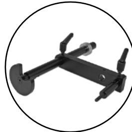
Manual Back Stop (Included) P/N:MBS-60