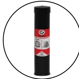
Available: CRIMPX Die Lubricant 3 oz mini grease tube P/N:103887