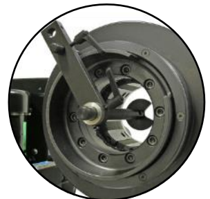
Manual Back Stop