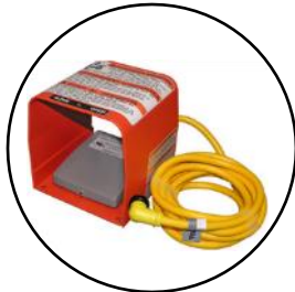
Foot Pedal Assembly (Included) P/N:104118