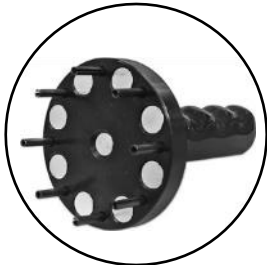
84mm Quick Change Tool (Included) P/N:102572