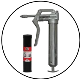
Mini Grease Gun w/ CRIMPX Die Lubricant 3 oz mini grease tube (Included) P/N:103889