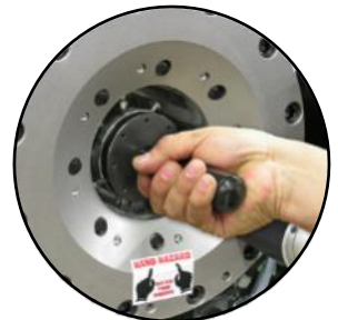
Quick Change Tool