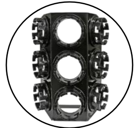
Die Rack 9 Station Die Holders (Included) P/N:102616-84mm