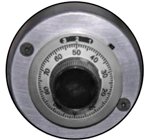
Metric Dial Micrometer