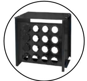
Available: Crimper Stand 16 Station Die Holders P/N:101247-84