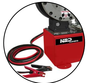
Available in 12VDC/24VDC