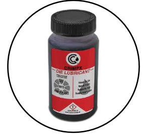
CRIMPX Die Lubricant: 4 oz bottle oil with dauber cap (Included) P/N:103886