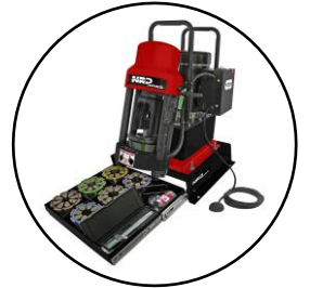
Crimper shown mounted on the Die Storage Drawer