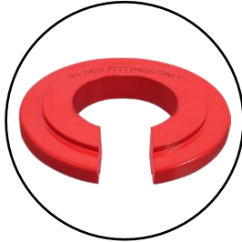
T420 Notched Pressure Plate (Optional) P/N:104662