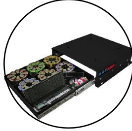
Die Storage Drawer (Optional) P/N:104650-Red Accessories sold separately