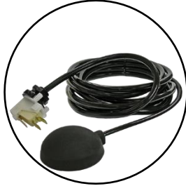
Pneumatic Pendant Switch (Included) P/N:101349