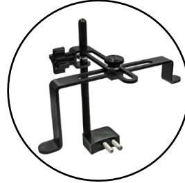
D165 Coupling Stop (Included) P/N:100954