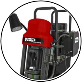
Flexible 24" Work Lamp (Optional) P/N:1668-02