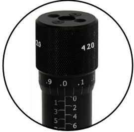
T420 Micrometer (Included) P/N:103085